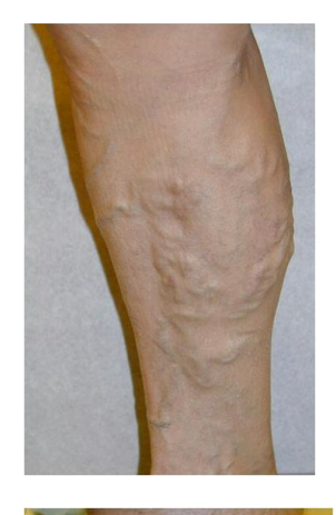
Before— VenaCure EVLT laser treatment

If your patient is a candidate for laser treatment, Metrolina Surgical Specialists can perform the procedure in their office for your convenience and in as little as an hour. Your patients can resume their normal activities the same day.