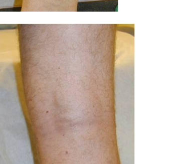
After— VenaCure EVLT laser treatment