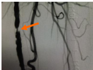
Pre-Atherectomy of Superficial Femoral Artery – 95% occluded

If your patient is a candidate for revascularization, Metrolina Surgical Specialists performs most vascular treatments using newer, minimally invasive procedures such as Angioplasty, Stents, and Atherectomy. The new procedures mean no incisions, less pain, faster recovery and shorter hospital stays.