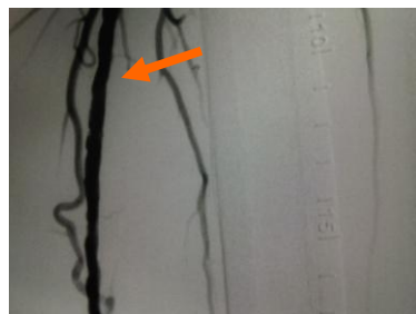
Post-Atherectomy of Superficial Femoral Artery*